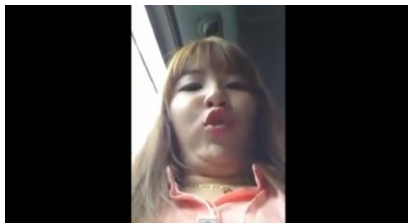
How Angles Effect your Photo's