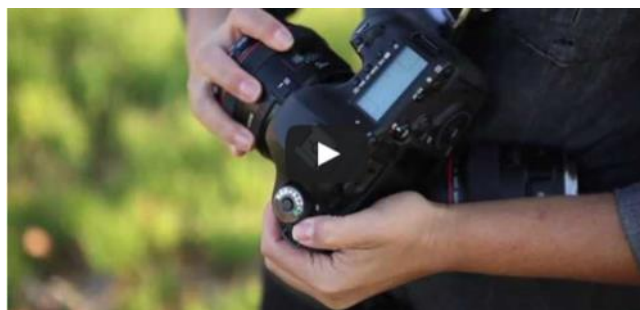
How to Quickly Change your Lens