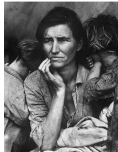
Image (top, right): Dorothea Lange (American, 1895-1965) Migrant Mother, Nipomo, California, 1933. Gelatin silver print.