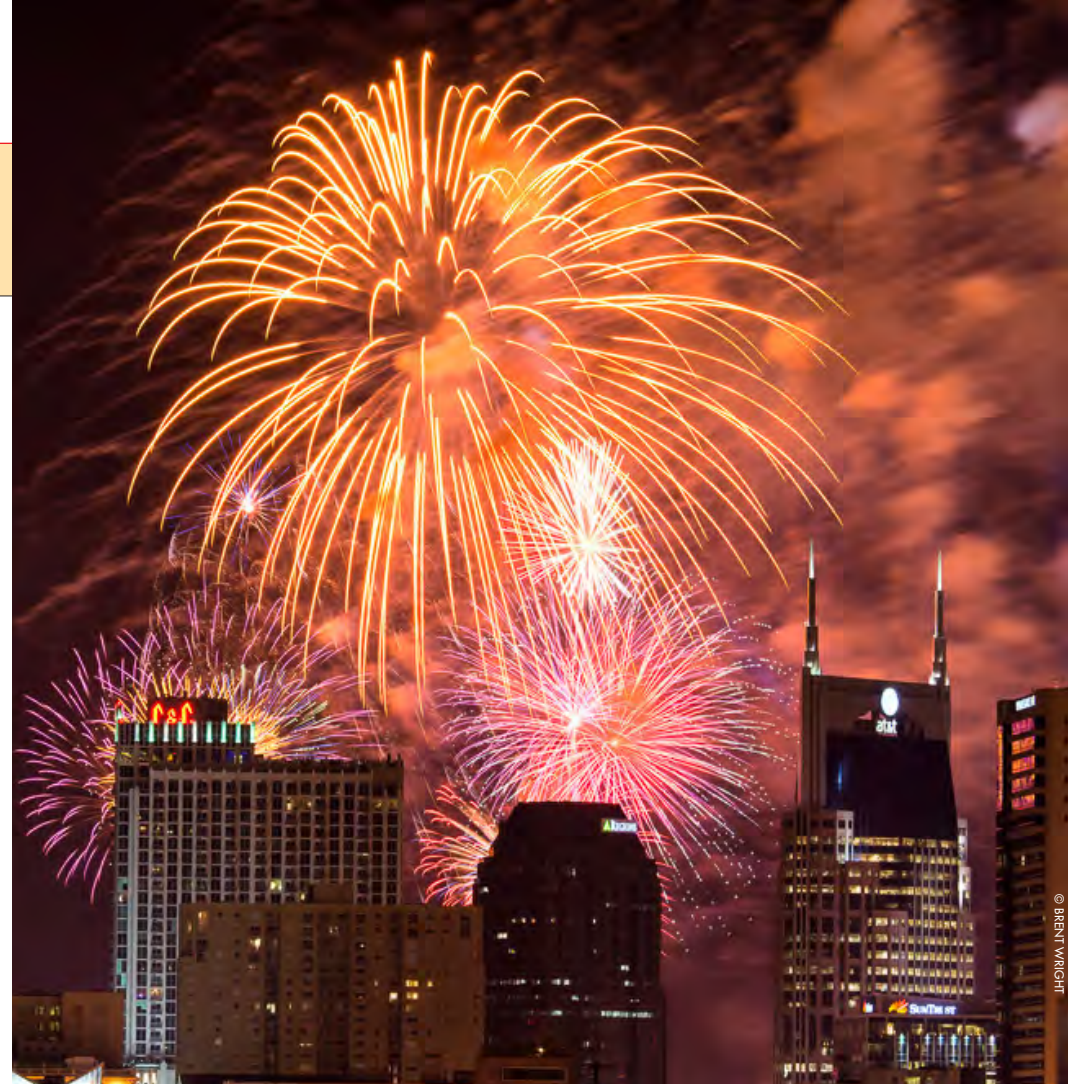
2014 FIREWORKS AND THE NPC MEMBERS WHO SHOT THEM

The Digital Group meets 6:00pm Tuesday of each month, March through October.