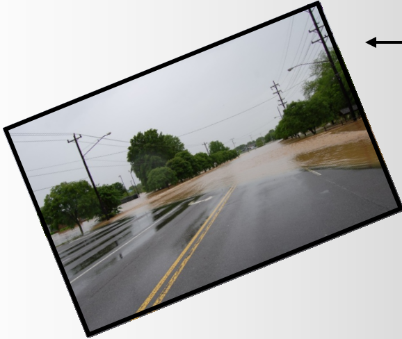
← This is looking west towards Drakes Creek and Old Hickory Lake which overtook Gallatin Road in Hendersonville, TN...5/2/10

Members of the public who want to help with relief efforts can contact Hands On Nashville . Its number is 298-1108.