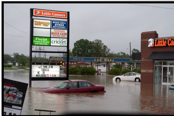
← Heading south on Murfreesboro road in Laverne, TN. 5/1/10