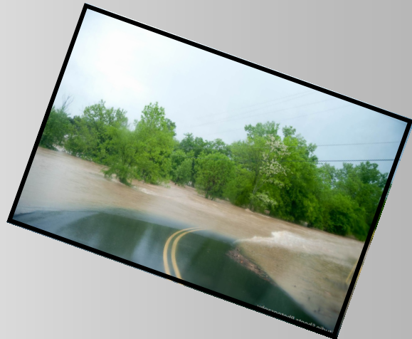
→ This is looking towards the bottom of the hill on Liberty Lane in Hendersonville, TN. 5/1/10