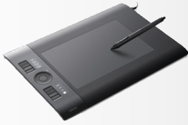
Wacom PTK640 Intuos4 Medium Pen Tablet