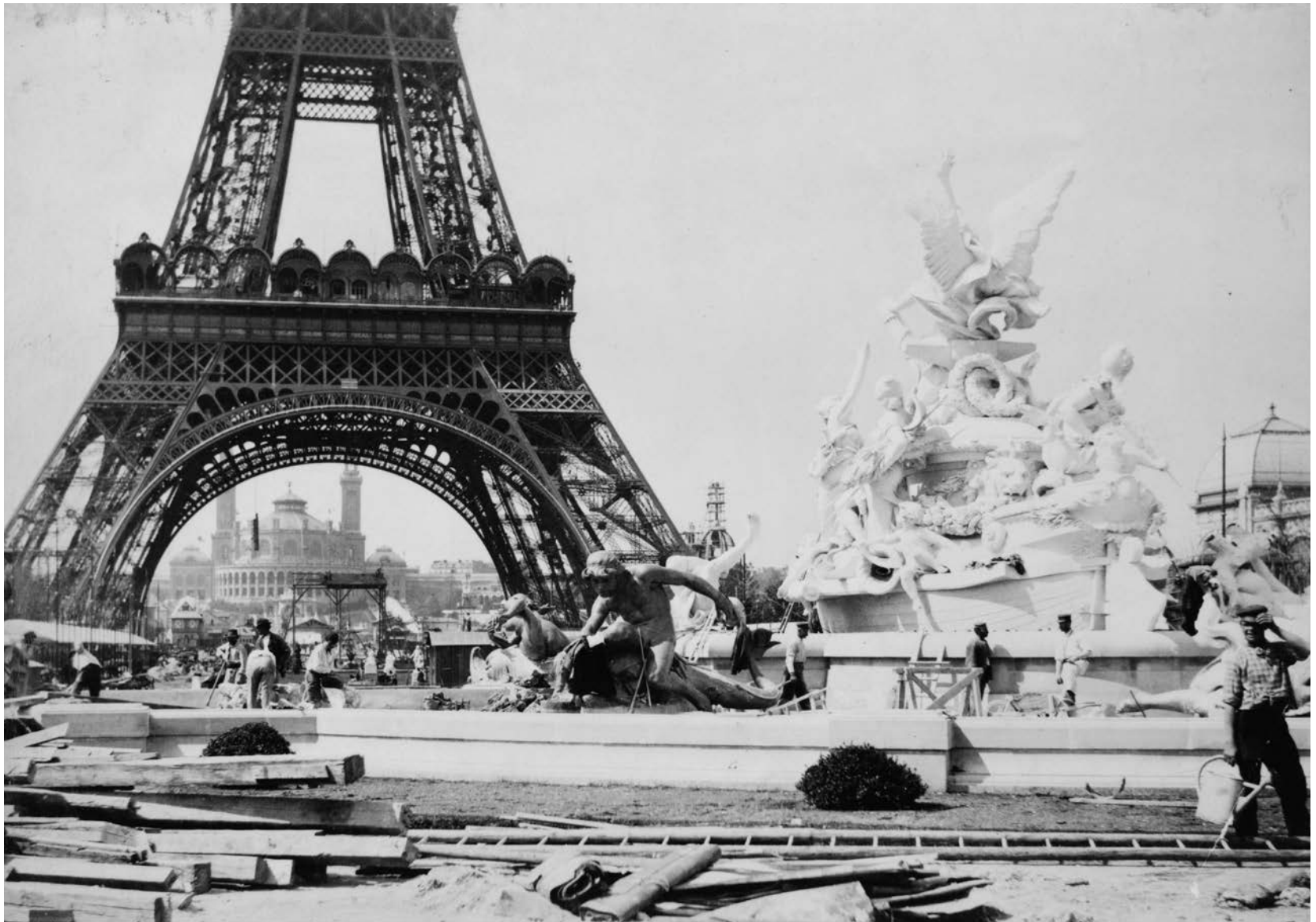
MEN BUILDING THE FOUNTAIN ST. VIDAL NEAR THE EIFFEL TOWER, PARIS EXPOSITION, 1889

LIBRARY OF CONGRESS ALBERT TISSANDIER COLLECTION