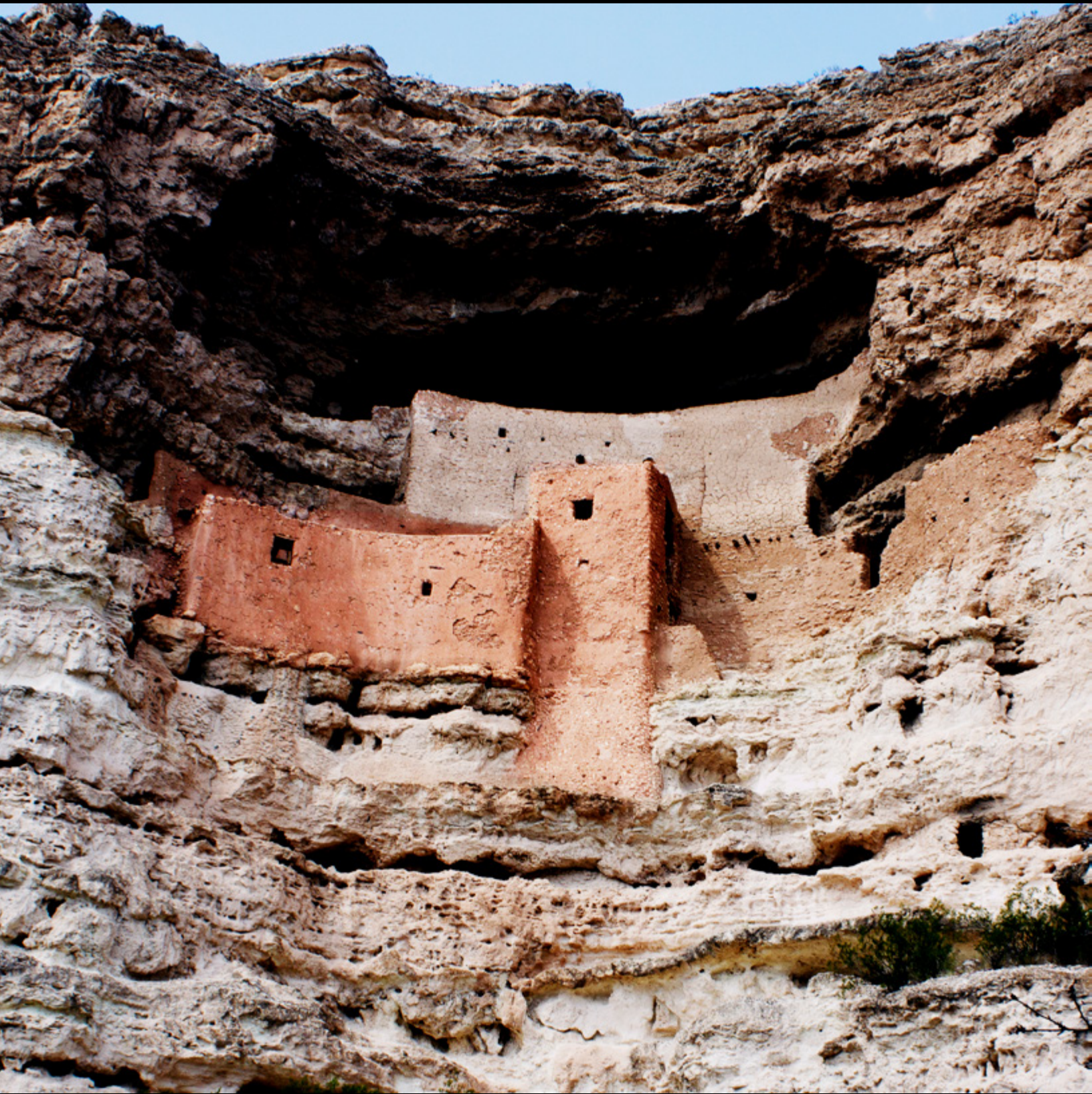
MONTEZUMA CASTLE