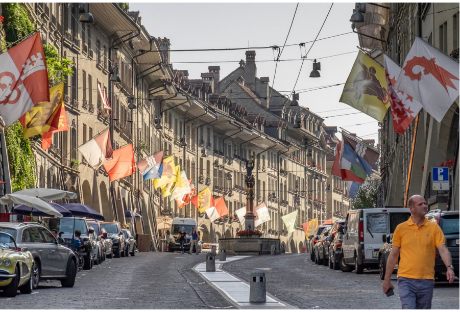
▲ SECOND PLACE: Denise Bartels