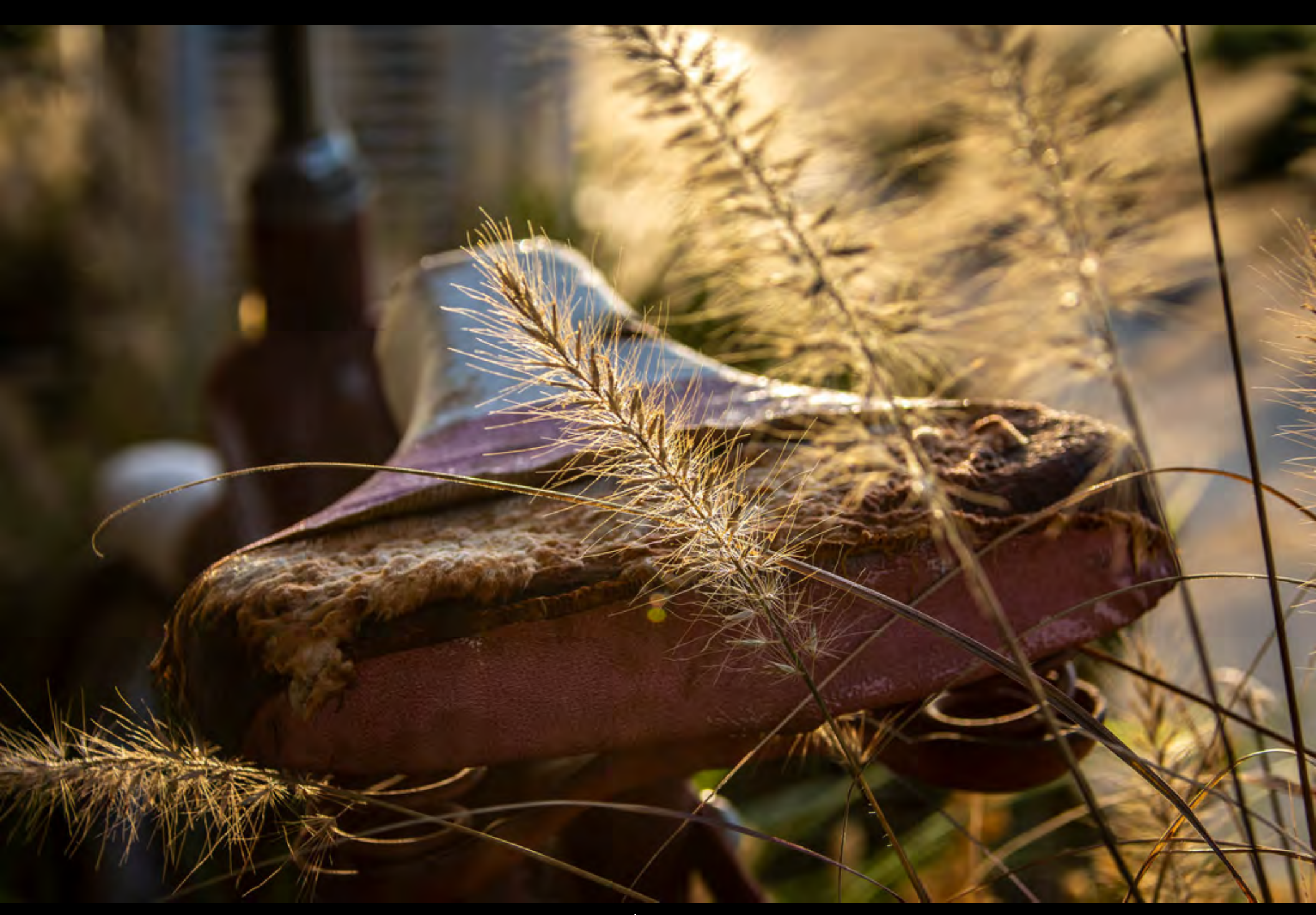
HAVE A SEAT | ©KENNA DOSSETT