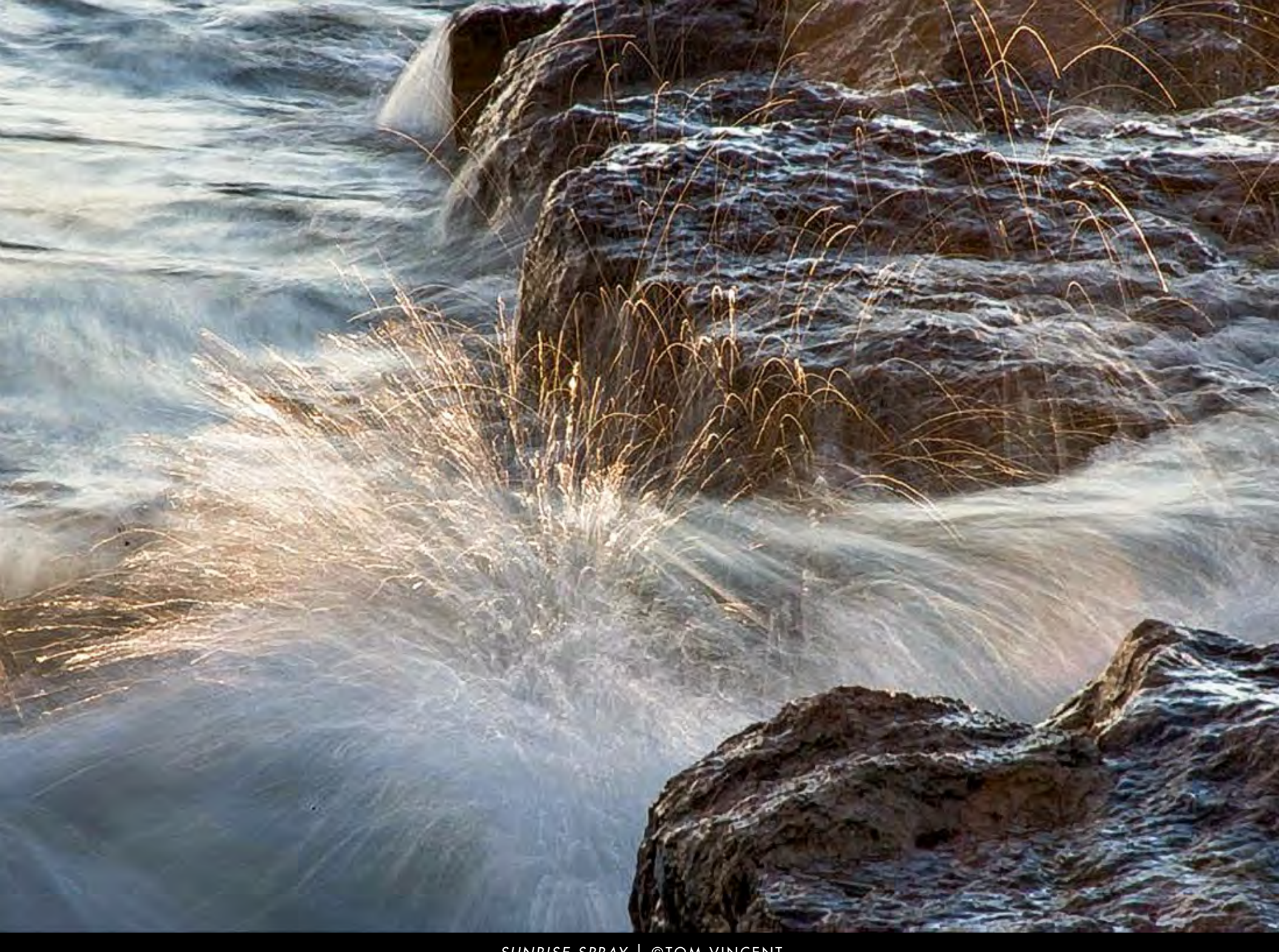
SUNRISE SPRAY | @TOM VINCENT