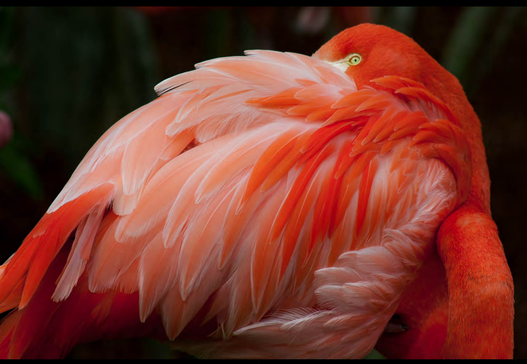
"THINK PINK"