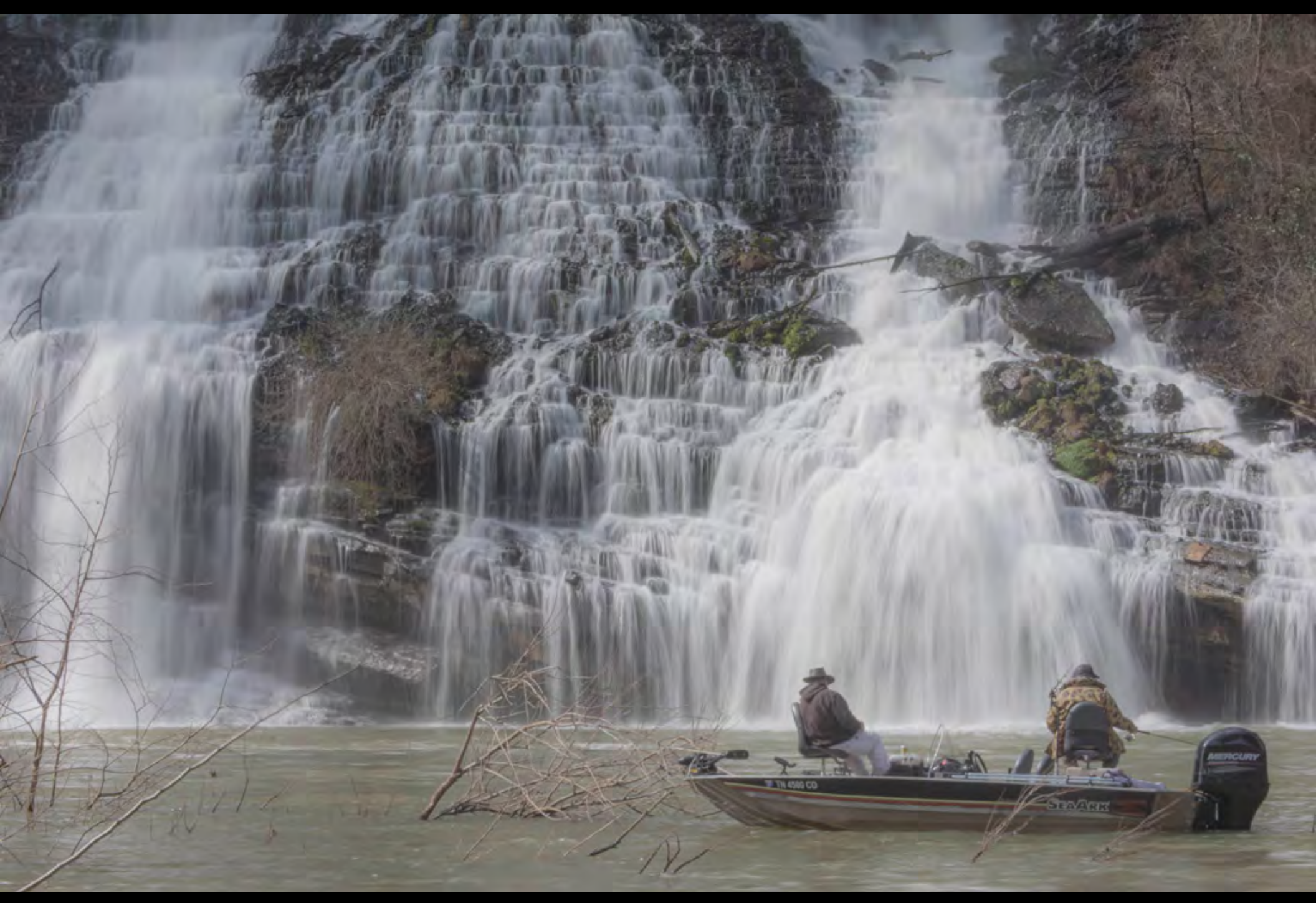
GONE FISHING