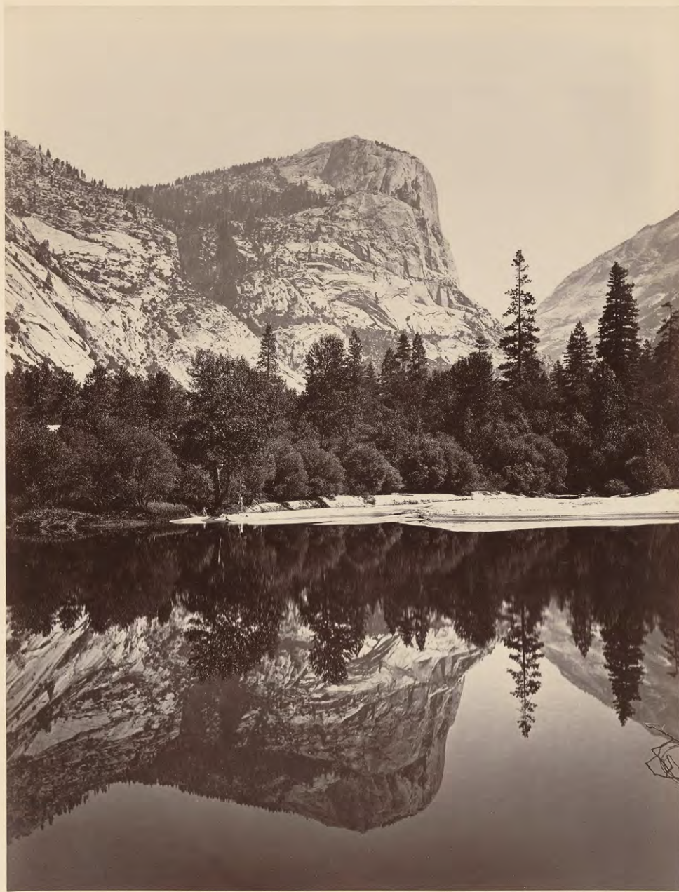
Mirror Lake Yosemite