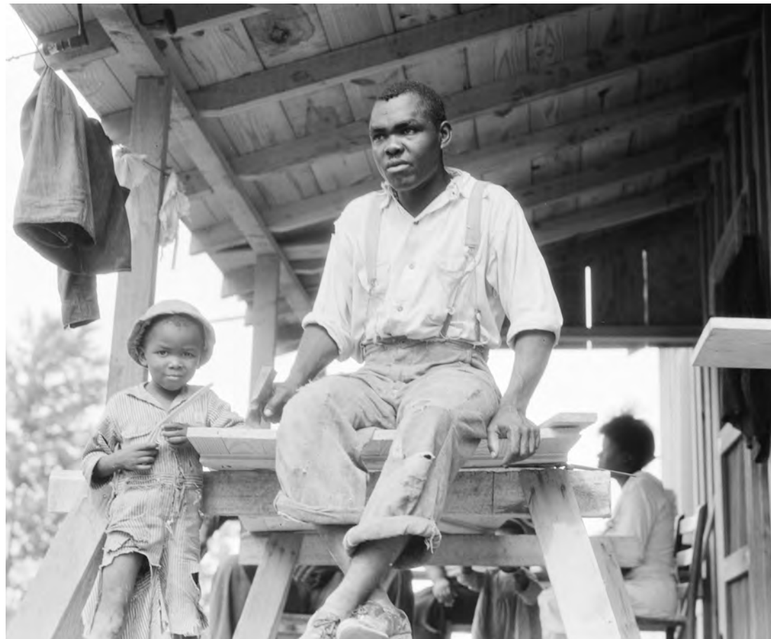
DOROTHEA LANGE, EVICTED ARKANSAS SHARECROPPER, ONE OF THE MORE ACTIVE OF THE UNION MEMBERS (SOUTHERN TENANT FARMERS UNION), NOW BUILDING HIS NEW HOME AT HILL HOUSE, MISSISSIPPI, JULY, 1938

“I many times encountered courage, real courage. Undeniable courage. I’ve heard it said that that was the highest quality of the human species. I encountered that many times, in unexpected places. And I have learned to recognize it when I see it.”