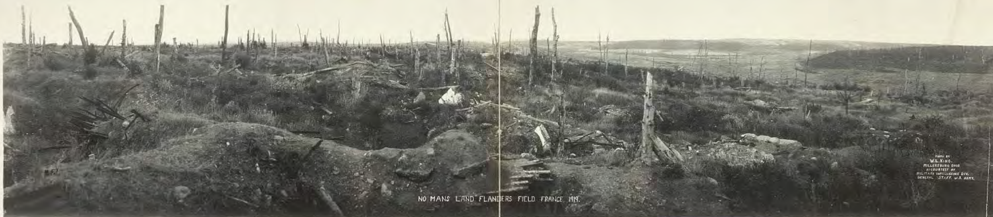
NO MANS LAND FLANDERS FIELD FRANCE 1919