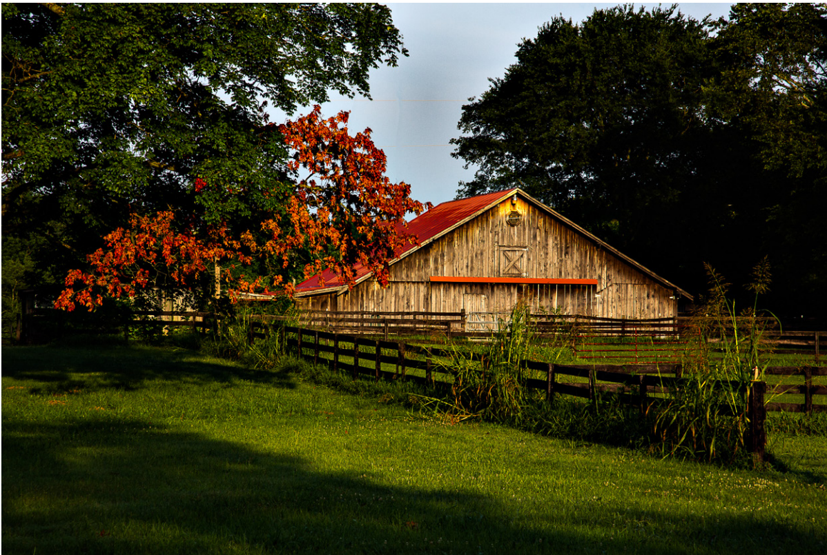
▲ FIRST PLACE: Pat Hollander