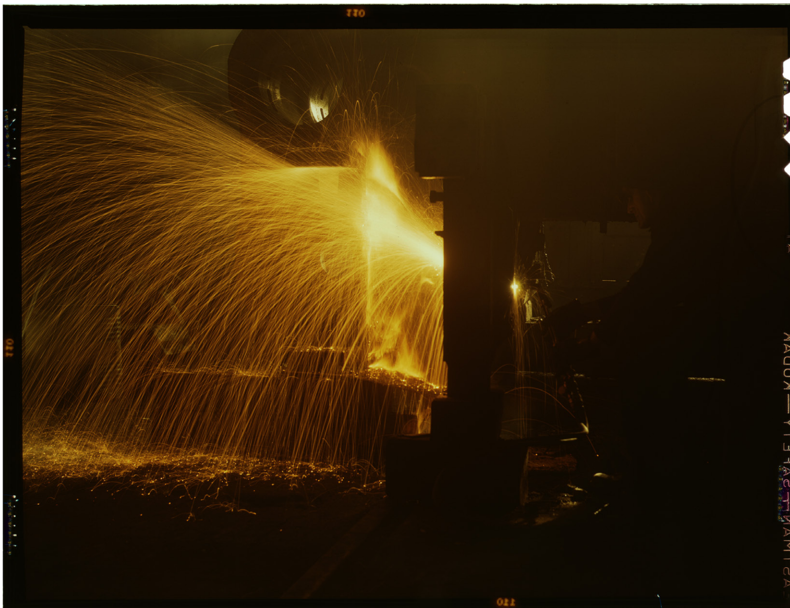
A WELDER WHO WORKS IN THE ROUND-HOUSE AT THE CHICAGO AND NORTHWESTERN RAILROAD'S PROVISO YARD DECEMBER 1942