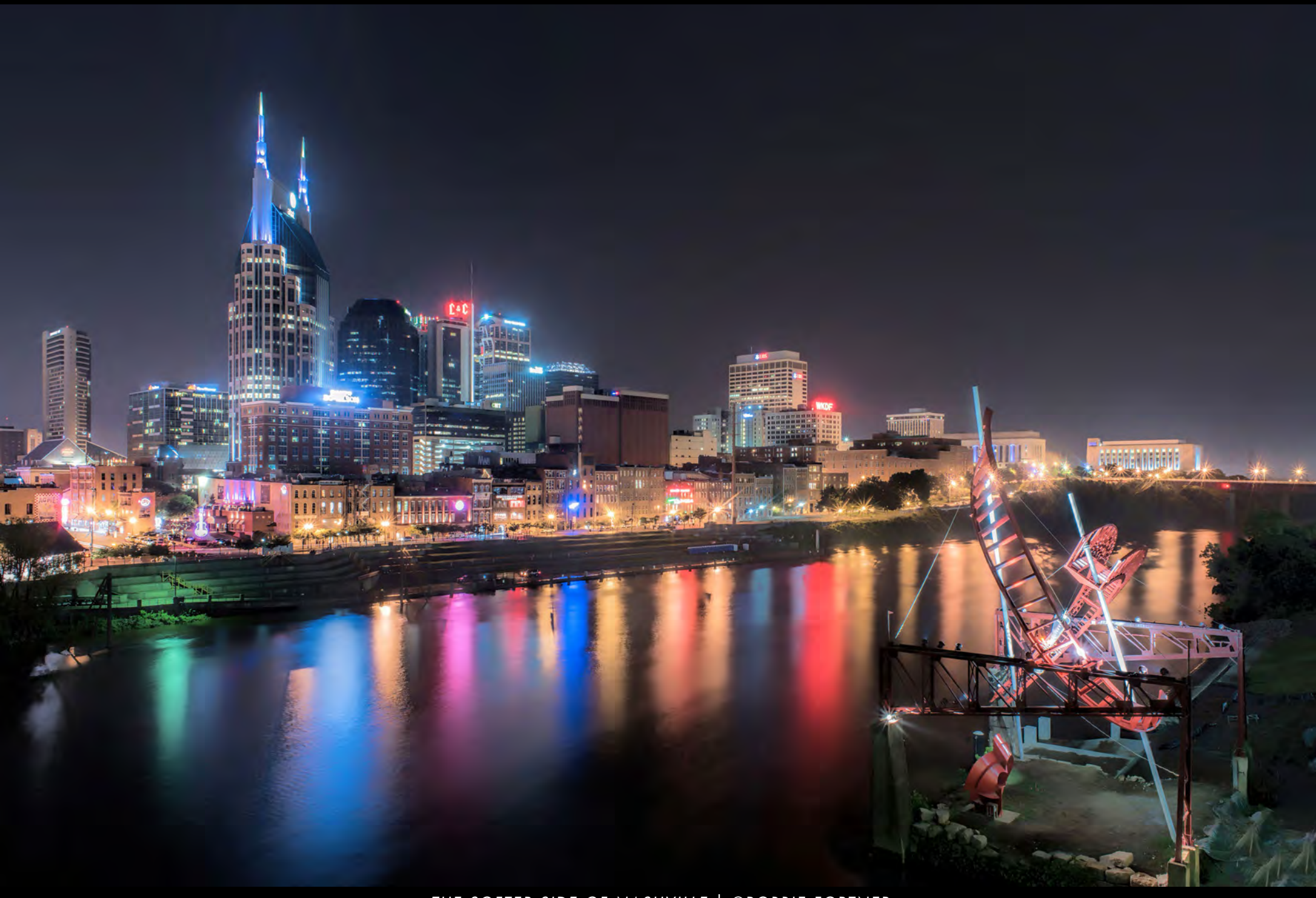
THE SOFTER SIDE OF NASHVILLE | @ROBBIE FORTNER