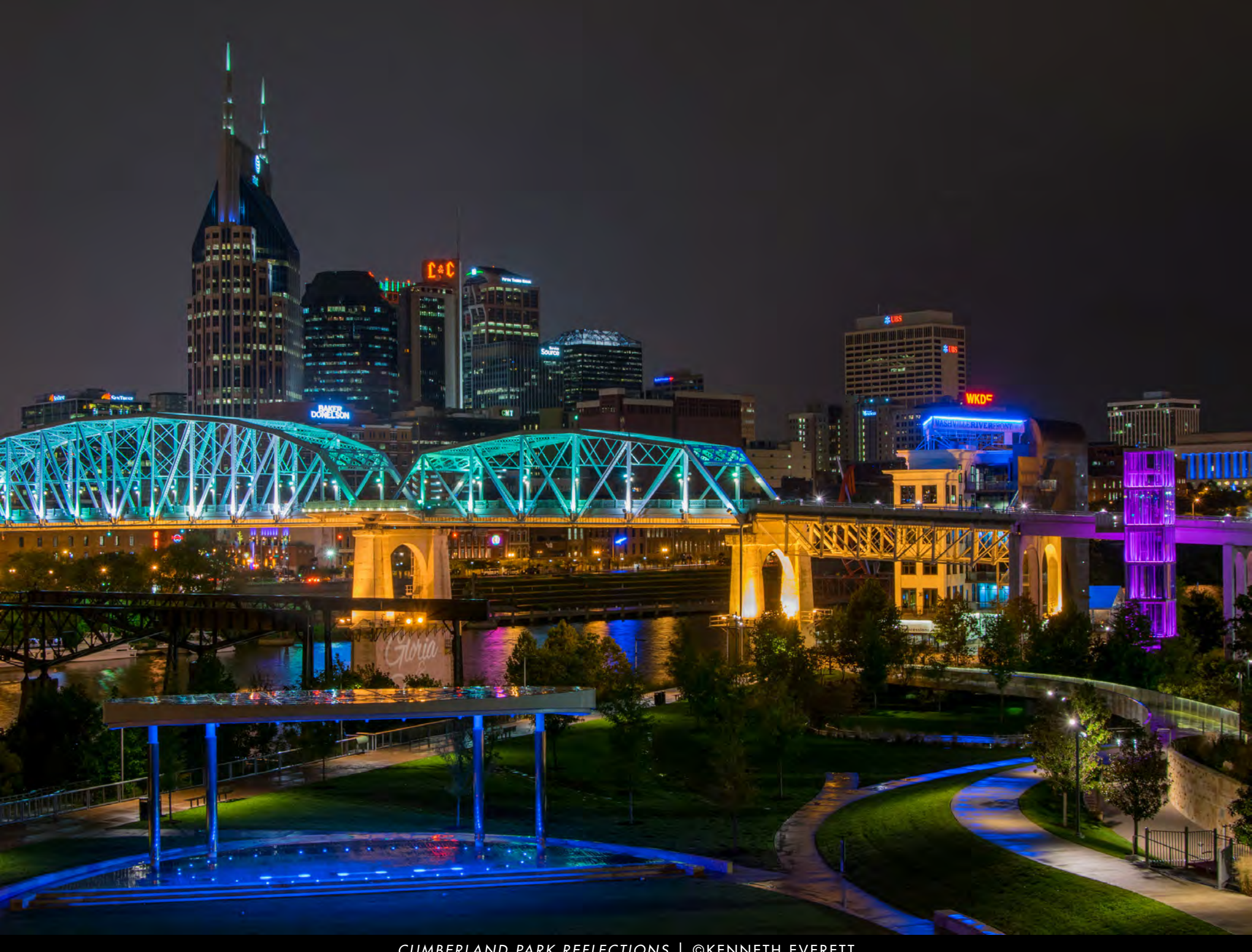
CUMBERLAND PARK REFLECTIONS