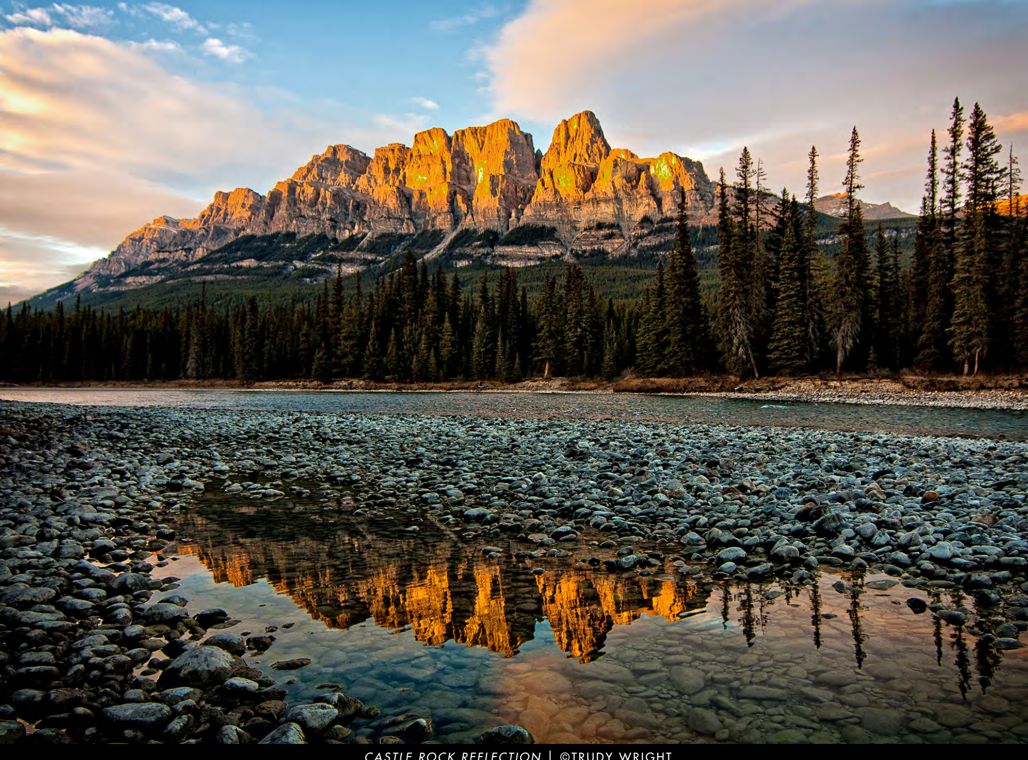
CASTLE ROCK REFLECTION