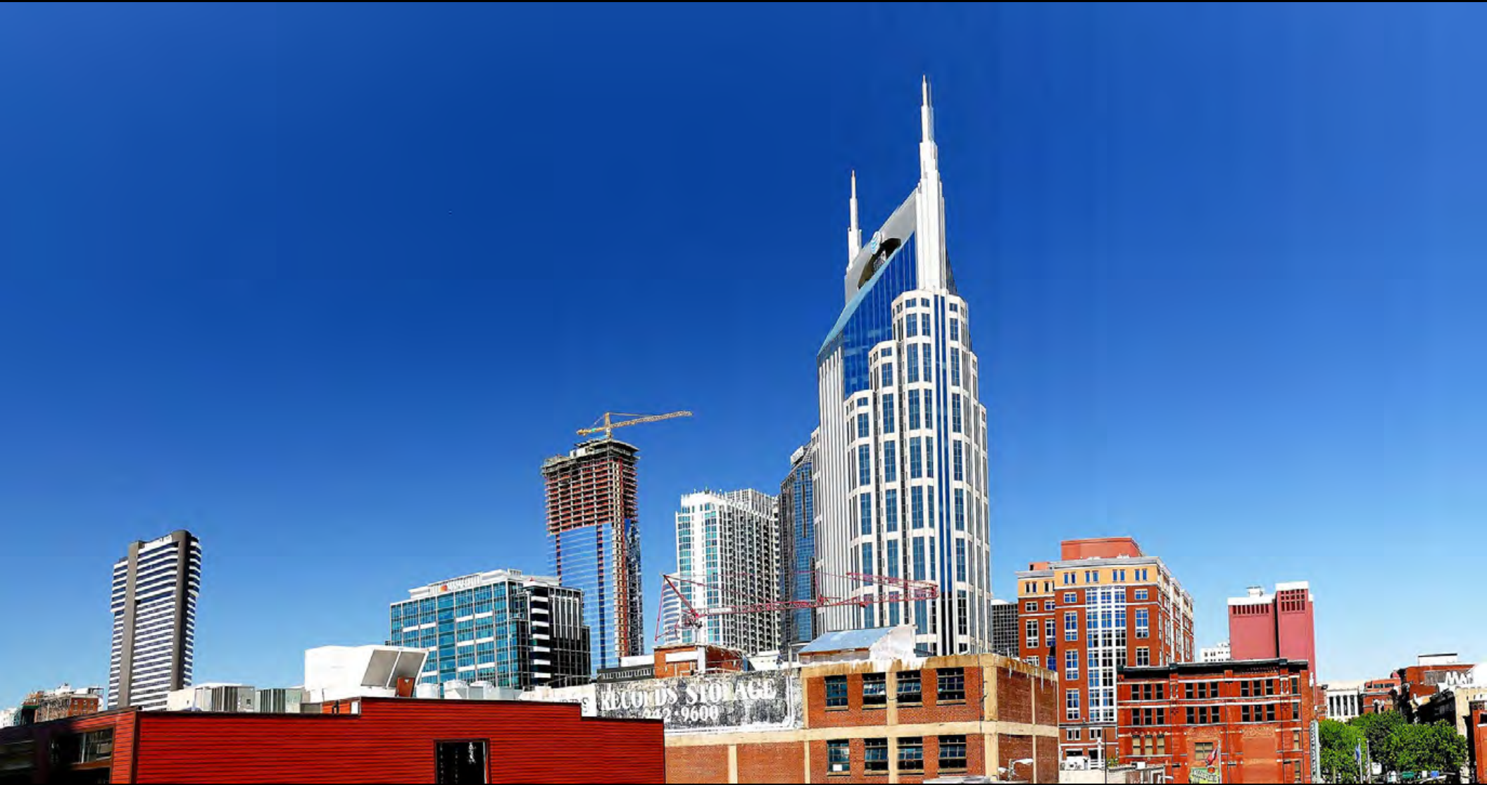
PROGRESS IN TUNE TOWN | ©RICK AUTERY