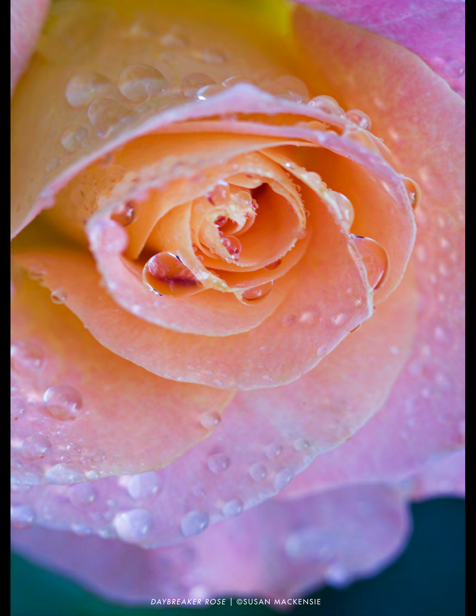
DAYBREAKER ROSE