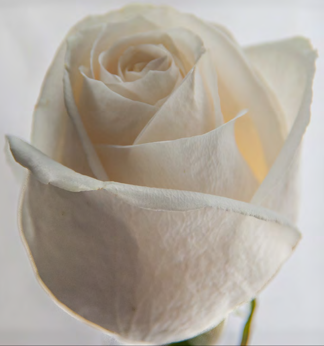
BETTY'S ROSE | ©KENNA DOSSETT