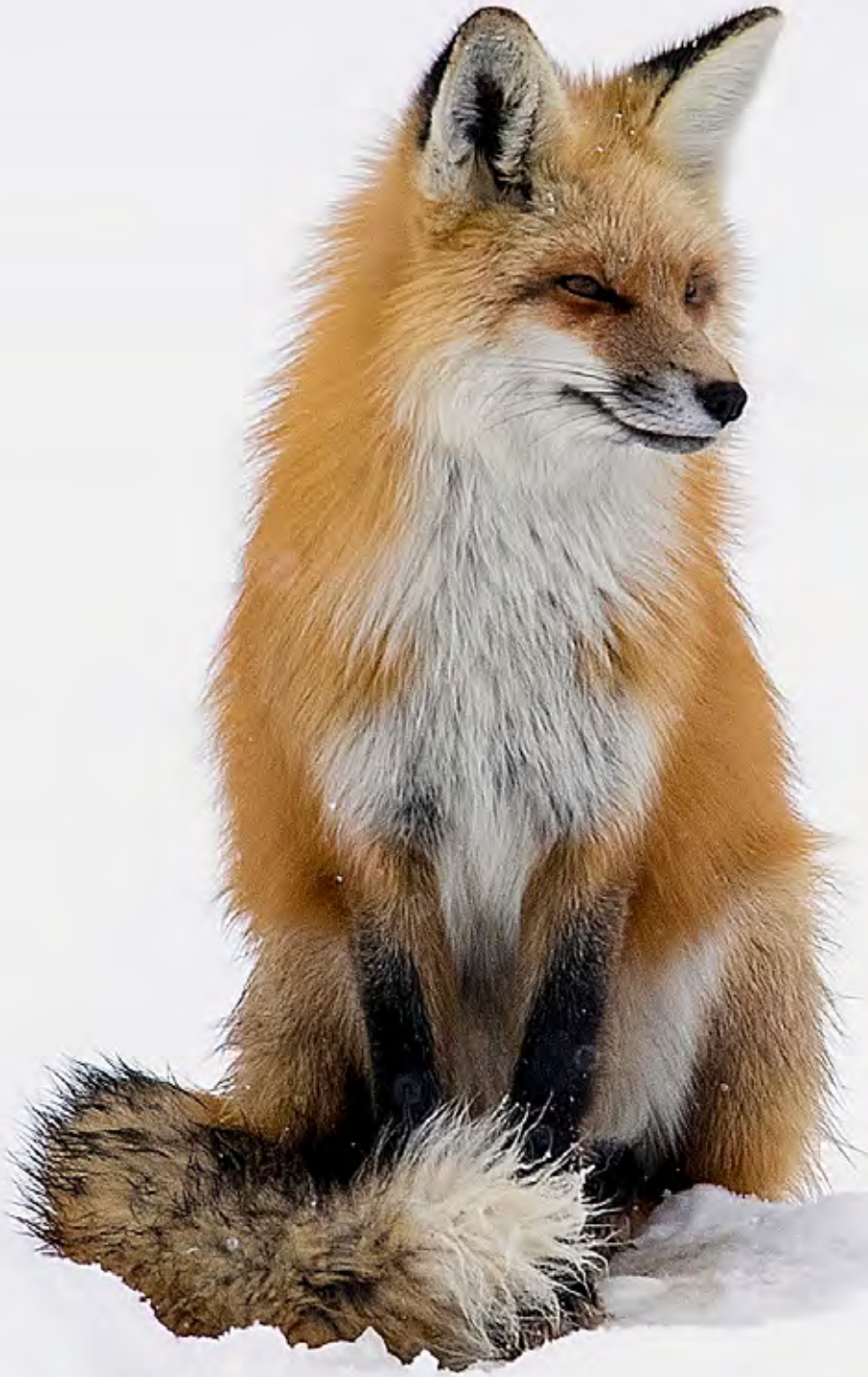
RED FOX IN SNOW