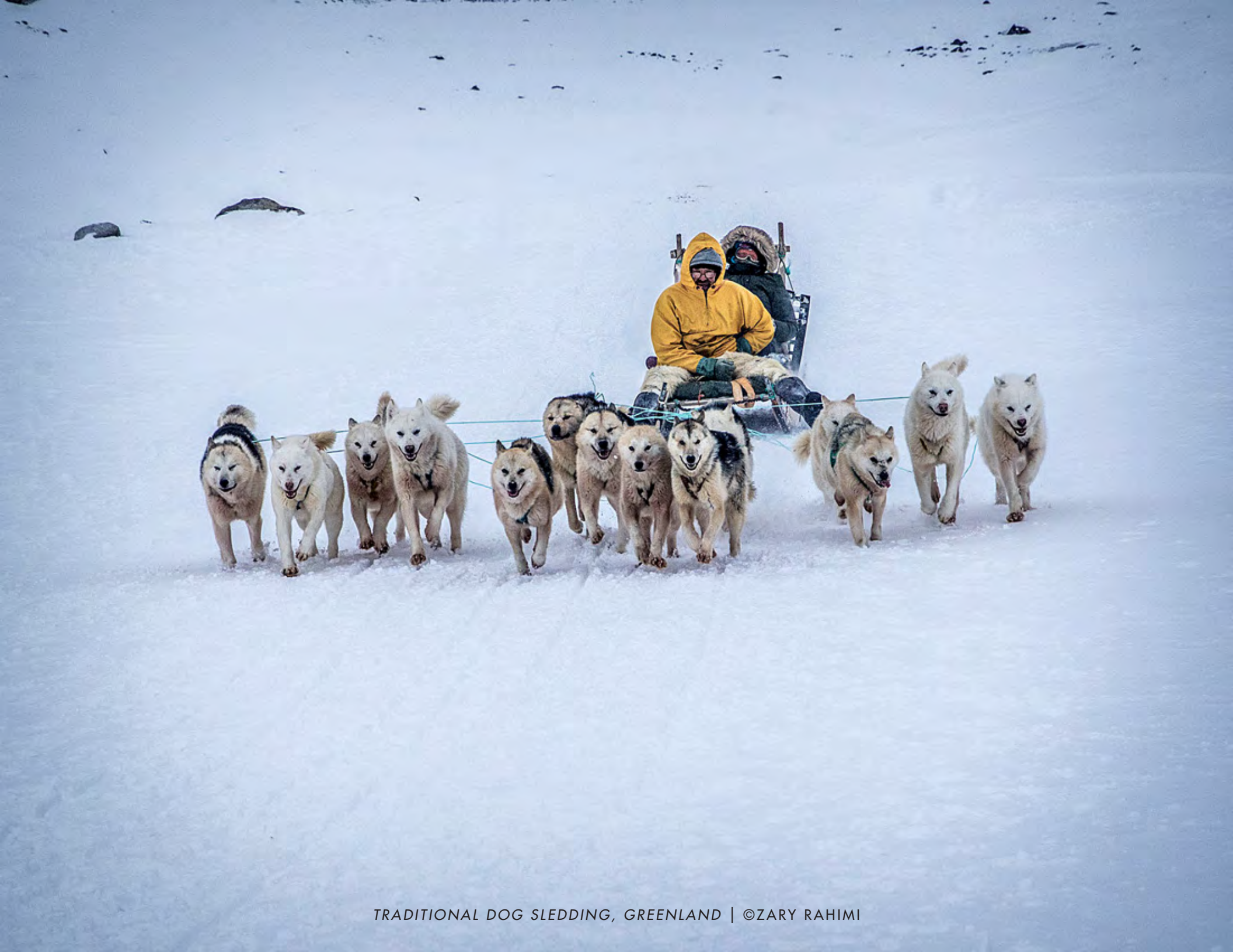
TRADITIONAL DOG SLEDDING, GREENLAND