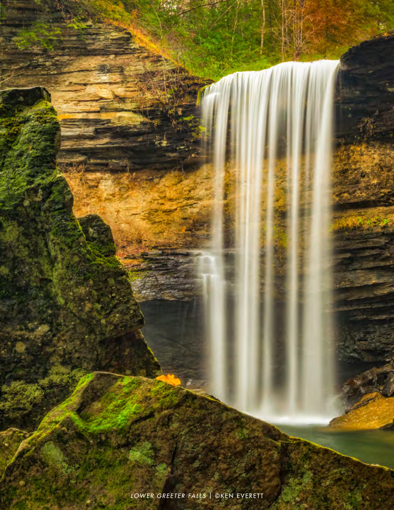
LOWER GREETER FALLS | ©KEN EVERETT