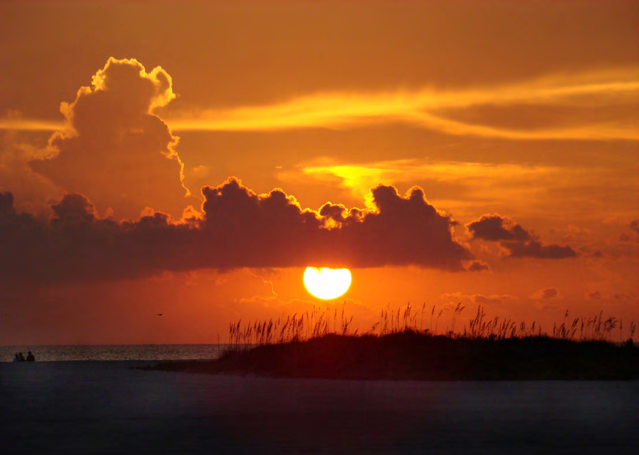
SUNSET AT TREASURE ISLAND