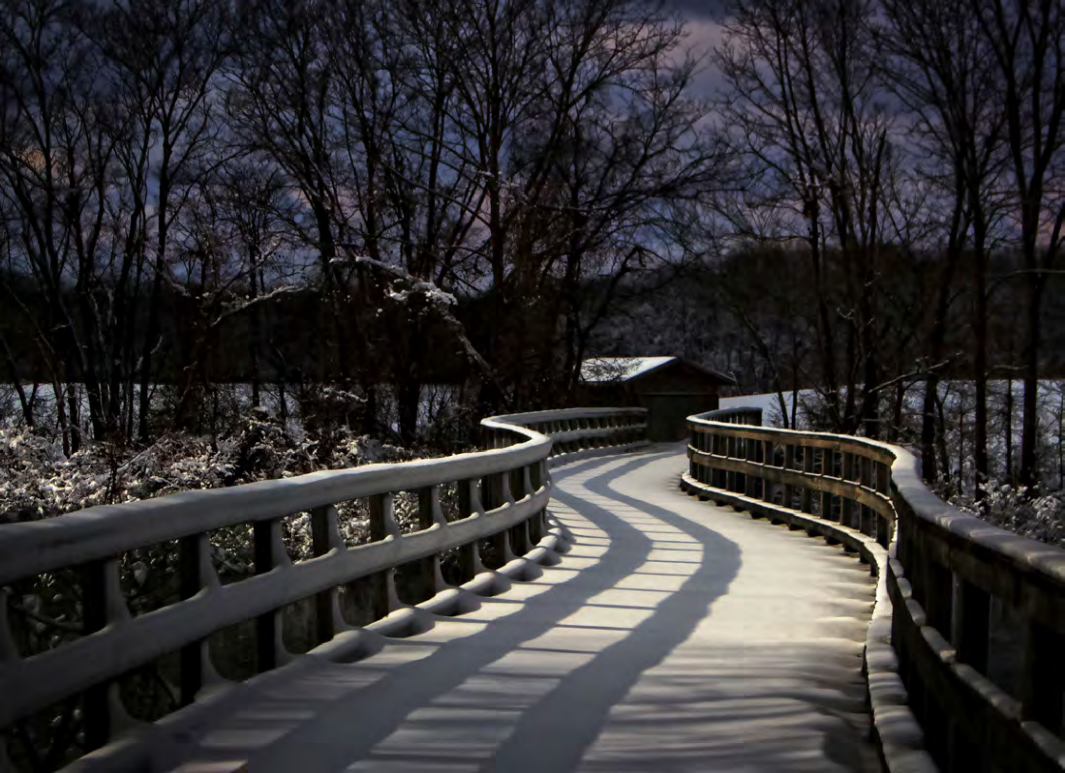
WINTER'S MOONLIT SHADOWS