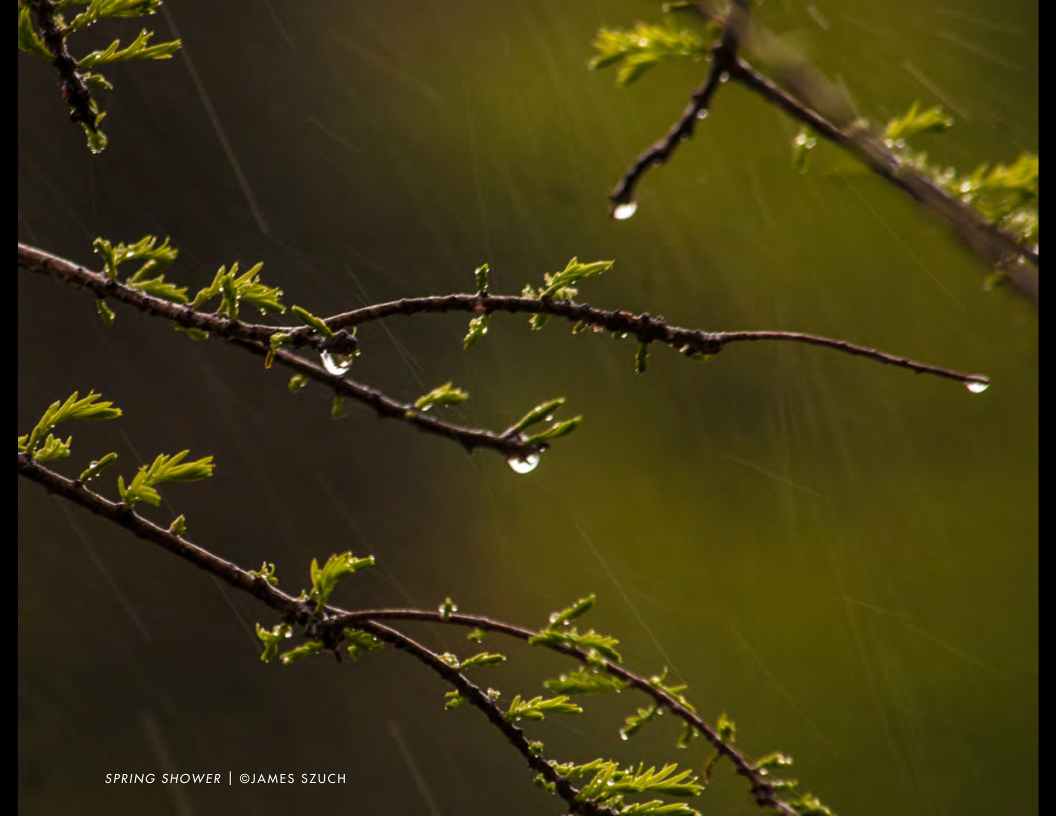
SPRING SHOWER