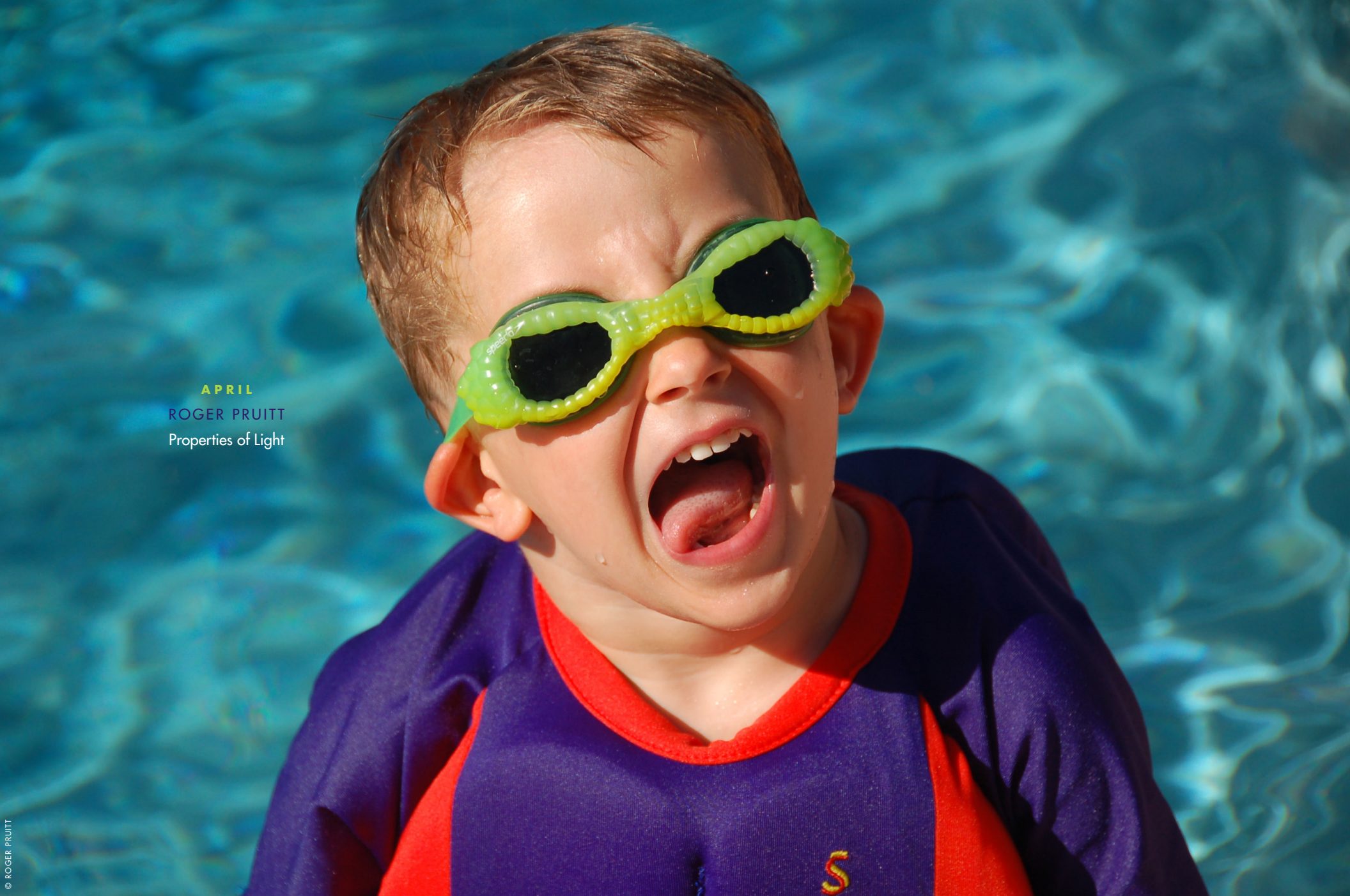
APRIL ROGER PRUITT Properties of Light