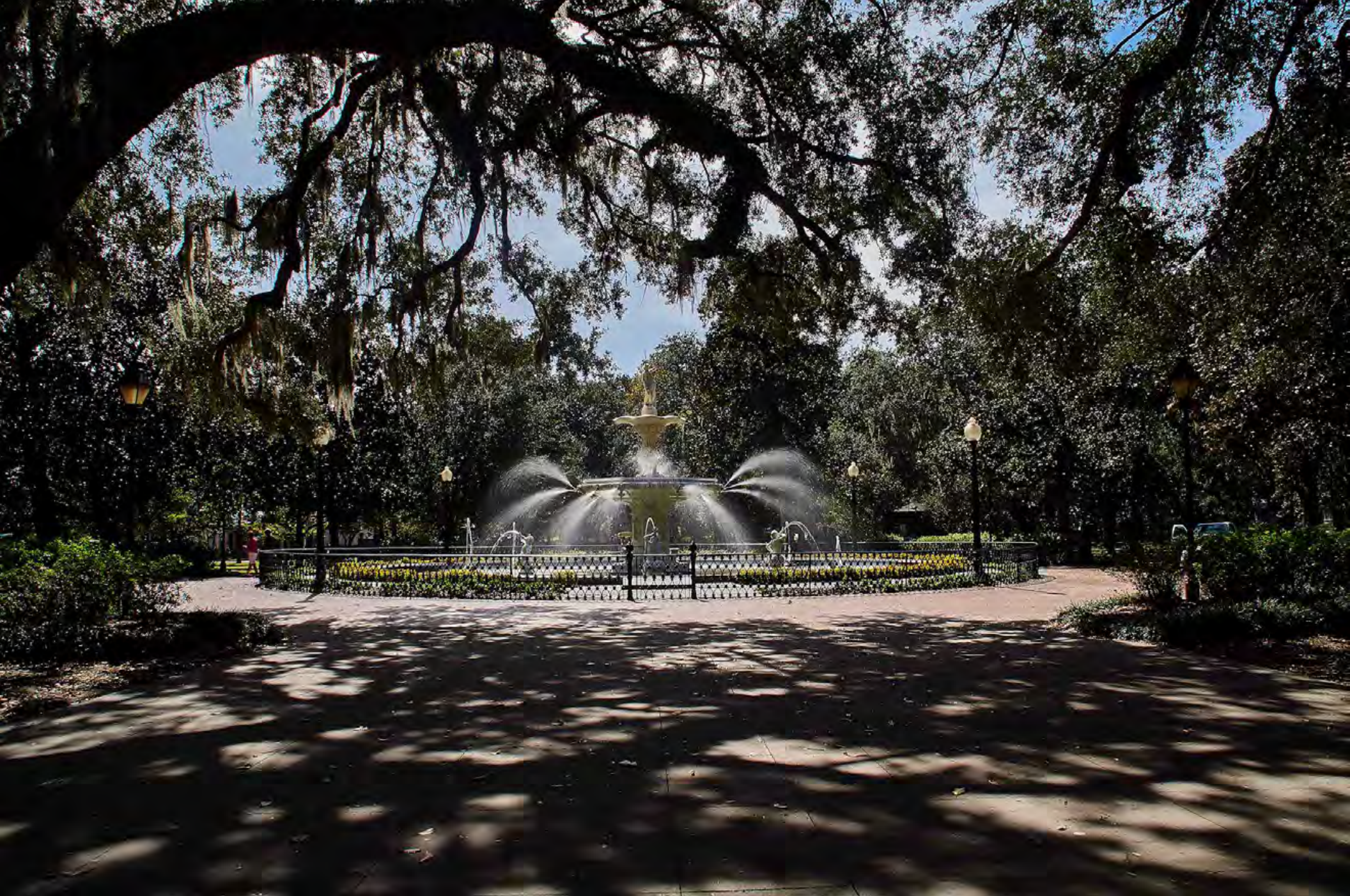
SAVANNAH'S MAIL ORDER FOUNTAIN