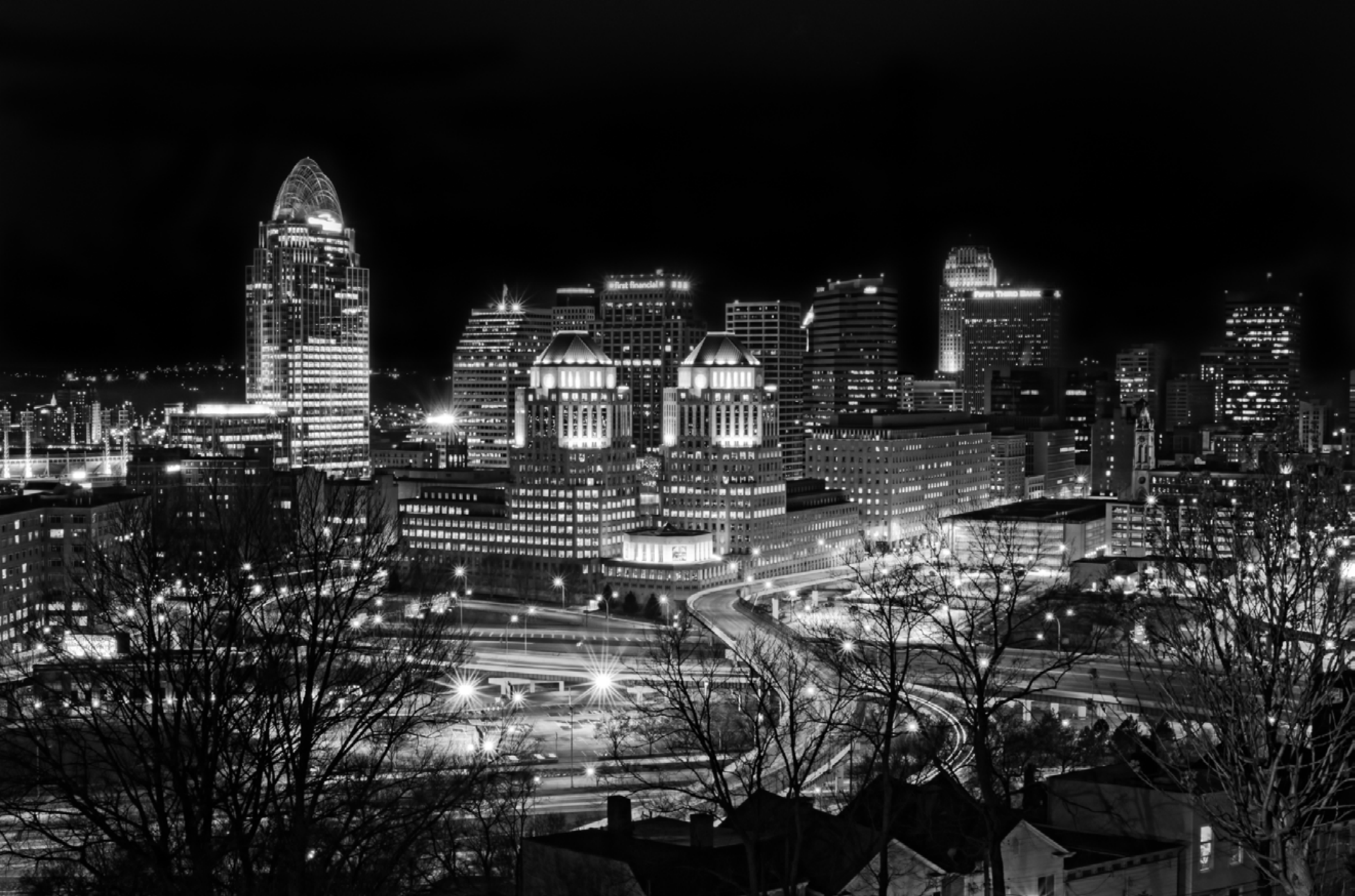
CITY OF 7 HILLS (B&W)