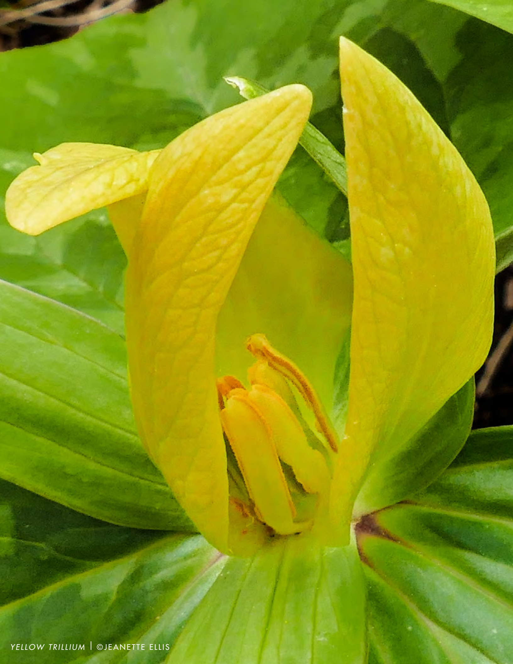
YELLOW TRILLIUM