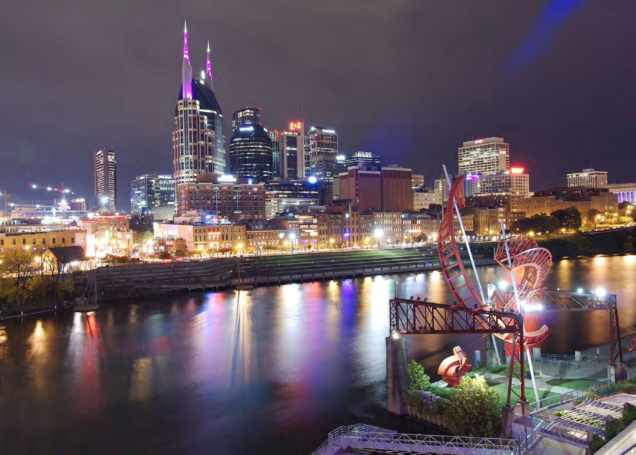
NASHVILLE—LIGHT THE NIGHT