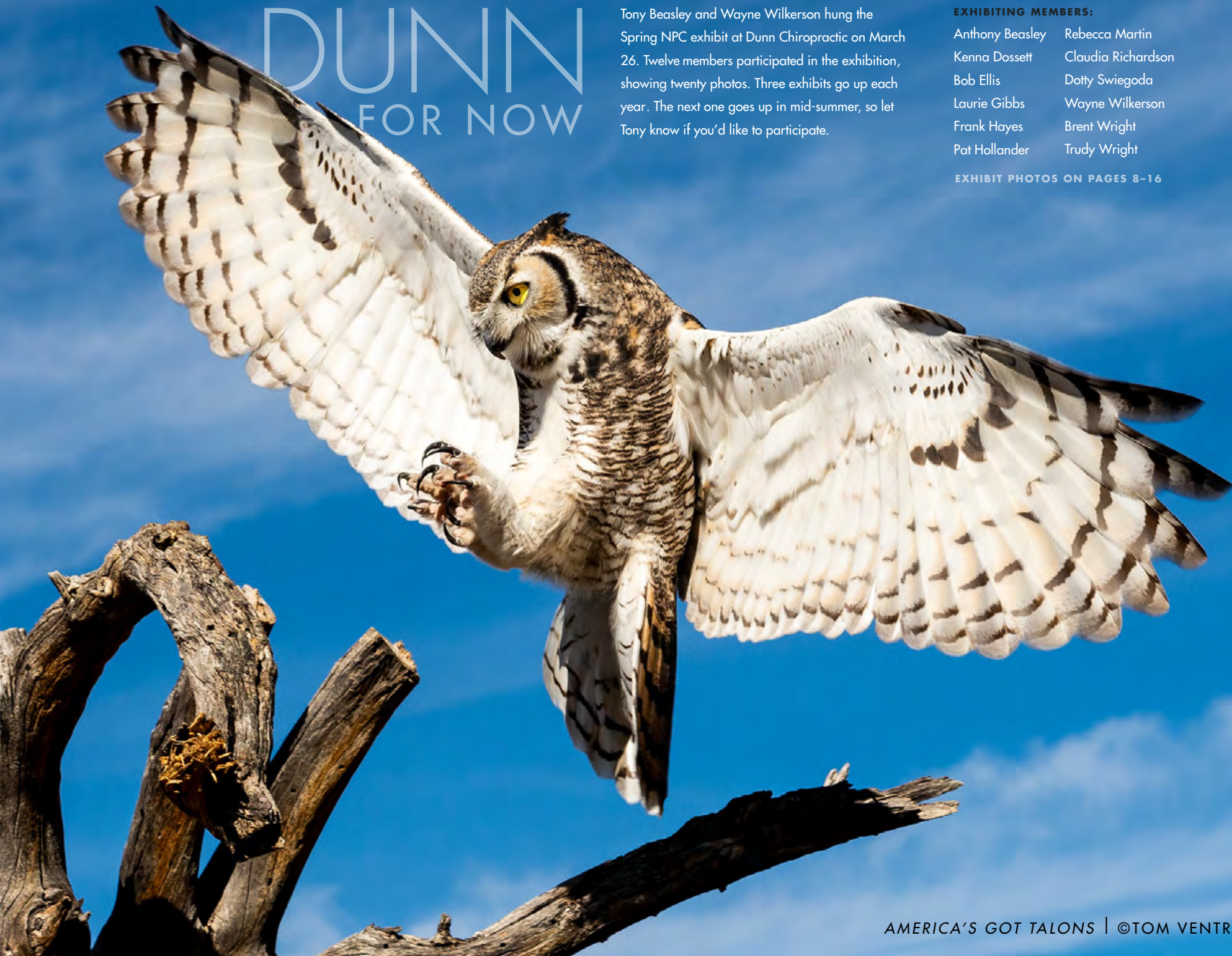
EXHIBIT PHOTOS ON PAGES 8-16