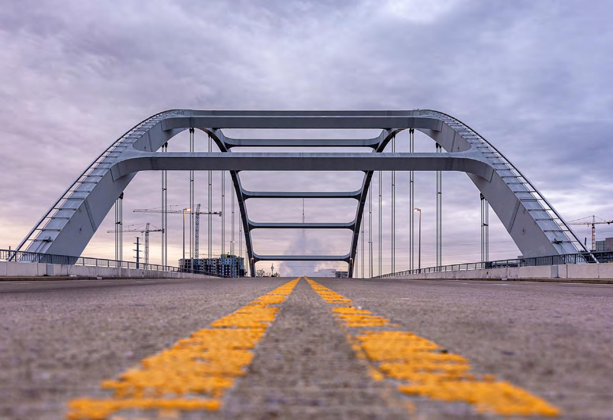
KOREAN VETERANS BRIDGE