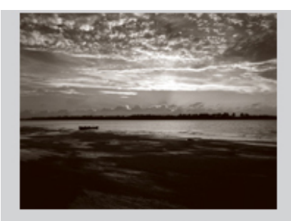
The River Inside Photographer John Guider's Amazing Journey Oct. 3 - Nov. 30, 2008