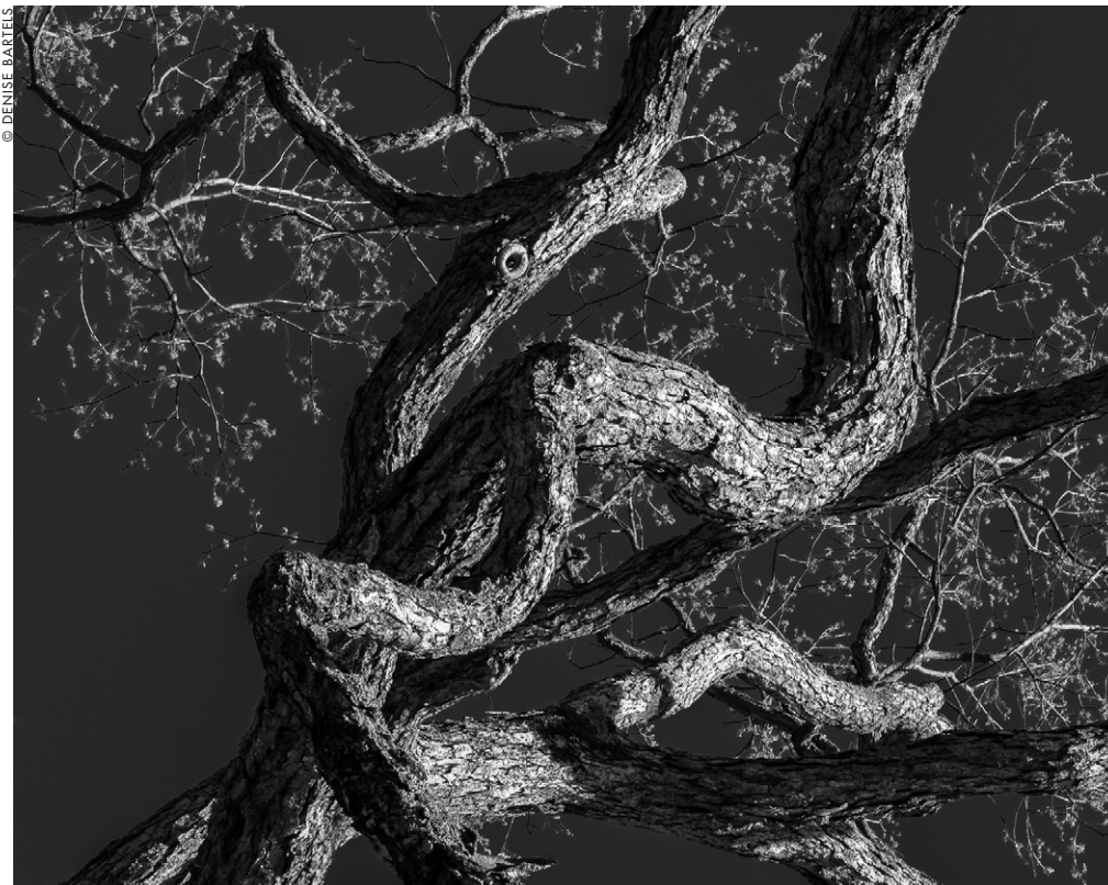
▲ SECOND PLACE: Denise Bartels