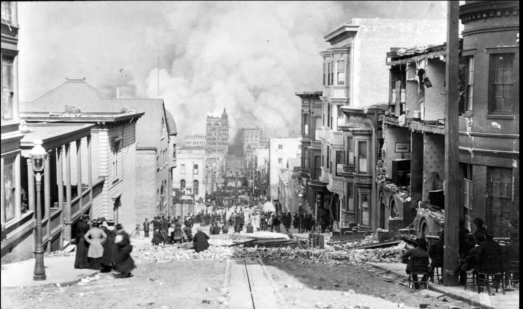
ARNOLD GENTHE (1869– 1942) LOOKING DOWN SACRAMENTO STREET, SAN FRANCISCO, APRIL 18, 1906

Arnold Genthe (January 8, 1869 – August 9, 1942) was a German-born American photographer. He is best known for his photographs of the 1906 San Francisco earthquake, as well as his portraits of noted people of the era—from politicians and socialites to literary figures and entertainment celebrities.