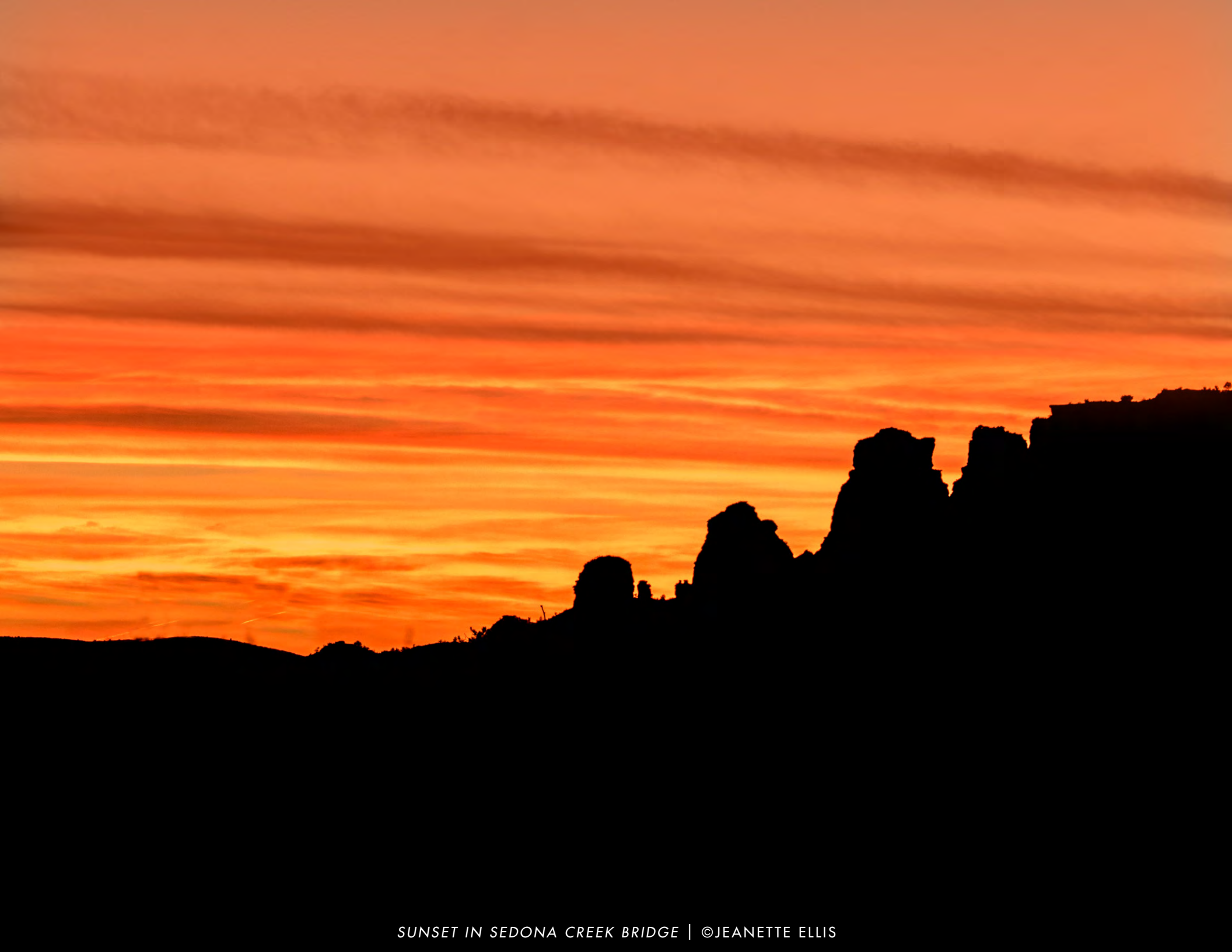
SUNSET IN SEDONA CREEK BRIDGE