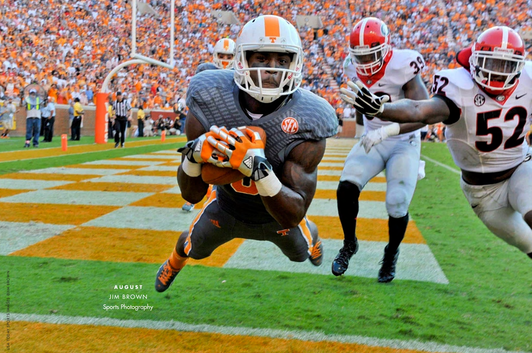
AUGUST JIM BROWN Sports Photography