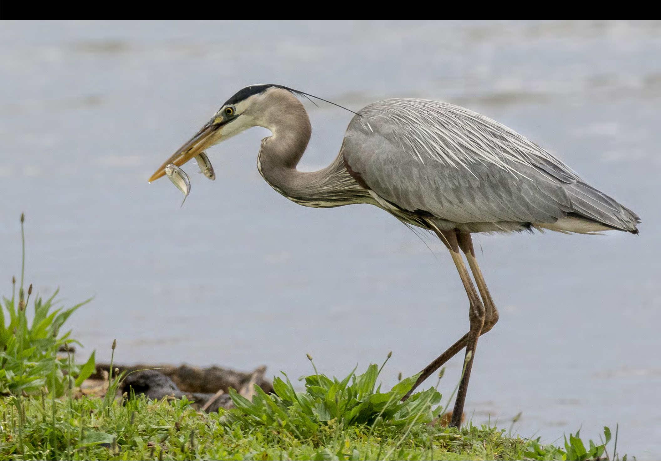
MORNING CATCH