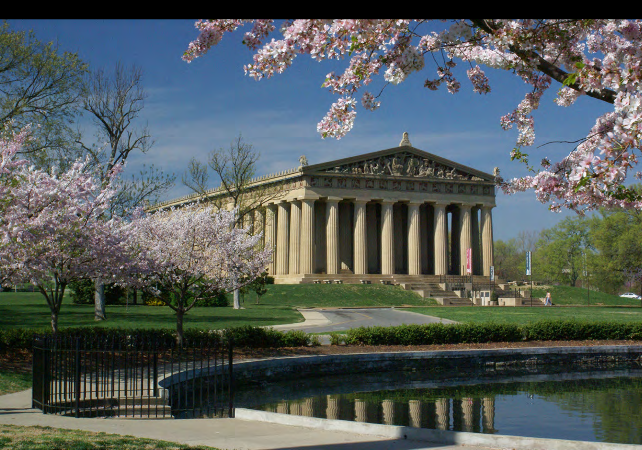
PARTHENON IN SPRING