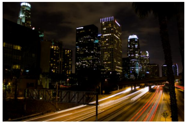
Captured with a 5 sec shutter speed

Basically, it's a hole in the lens that you can control by adjusting it smaller or bigger. Very little light gets to the sensor if it is a small hole. On the opposite end a big hole, the lens becomes like an open fire hydrant with light pouring through it. Think of it like your faucet in the kitchen sink. A quarter of a turn and the water is just dribbling out, small hole aperture. Open the faucet all the way and the water comes rushing out, big hole aperture. If you understand your cameras capabilities and the basics of photography, the quality of the images you take will increase greatly.