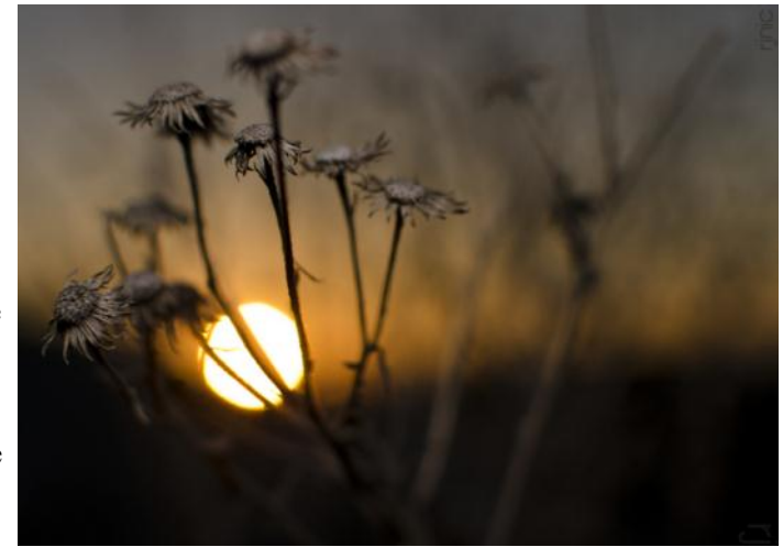
"six eighteen twelve"

F/5.6 in the example above brings us to f-stops or f-numbers which ever you prefer. This defines how wide your aperture is open or closed. The most common clicks on your camera's aperture dial are f/2.8, f/4, f/5.6, f/8, f/11 and f/16. These are "full" stops of light. Each f-stop number is 1.4 times larger than the one before it, and each full click from one stop to the next either doubles through the lens or cuts it in half, depending on which way you are turning the dial. The larger the f-numbers, the smaller the lens opening and the opposite is true for a larger lens opening the smaller the f-numbers. I was in the Army so we use a lot of acro-